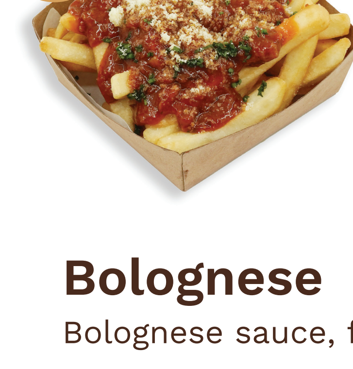
75 Bolognese Bolognese sauce, fries