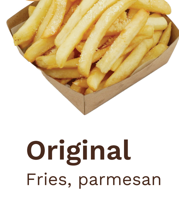
65 Original Fries, parmesan