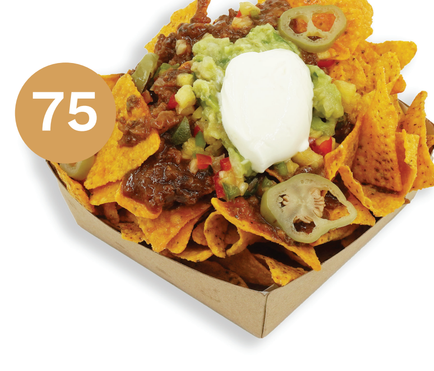
75 Nachos Con Carne 🍴 Bolognese sauce, parmesan, nachos, guacamole