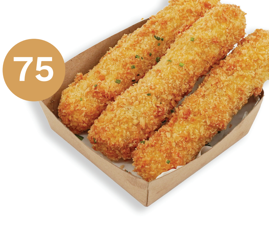
75 Mozarella Stick 🍴