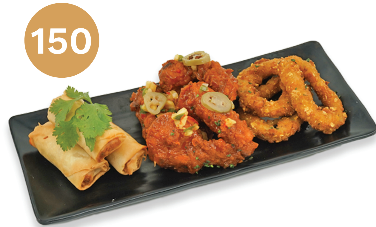
150 Padma Platter 🍴🌱 Vegetarian springrolls, BBQ chicken wings, calamary ring