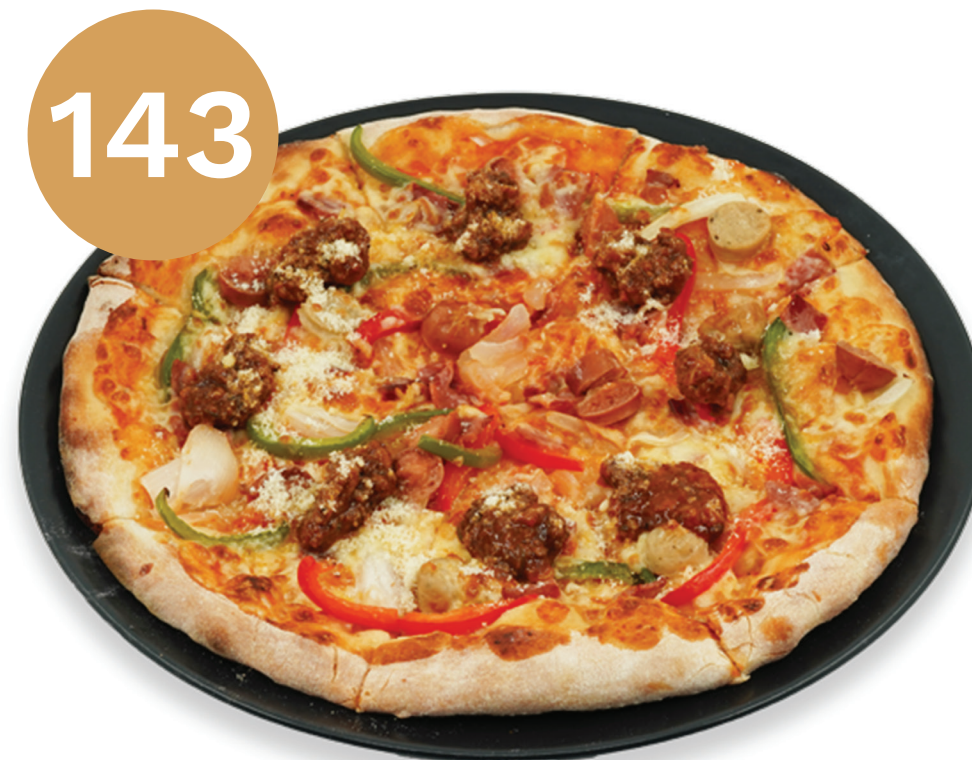
143 Meatlover Pizza 🍴 Beef salami, ground beef, chicken sausages, mozzarella, parmesan, tomato concasse, capsicum, basil